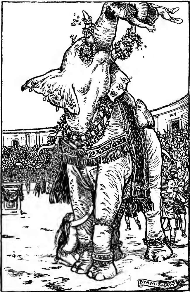
THE ELEPHANT AND PHILAMMON